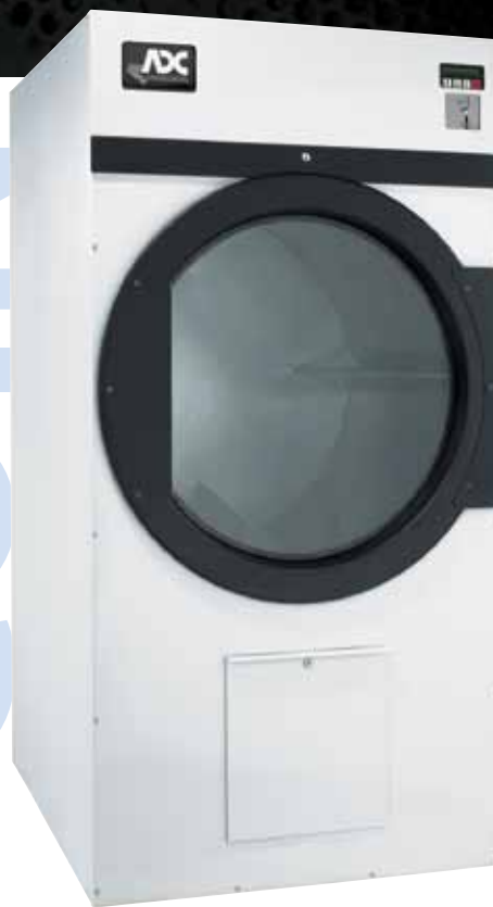
AD-758V Coin Dryer